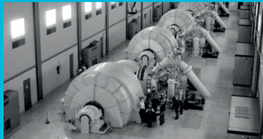
One of the machine halls in Aura power station

In the early 2000's Statkraft initiated an extensive cleanup project in the area. The Osbu reservoir and the Aursjø reservoir were rehabilitated. From 2005 both Aura and Osbu underwent major rehabilitations.