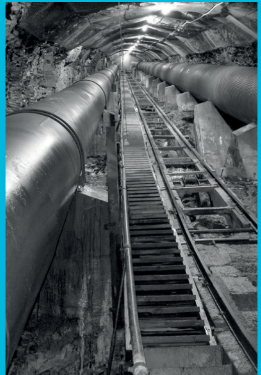
Waterway to Aura power station