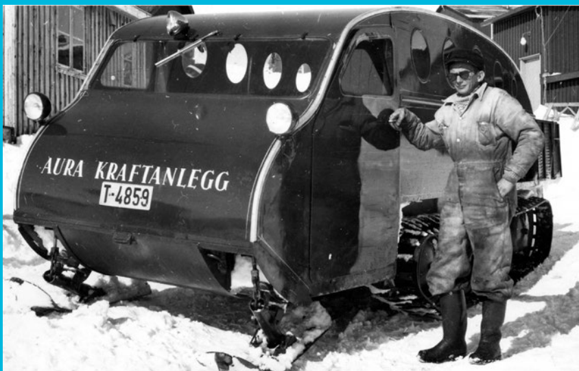
Snow mobile with driver